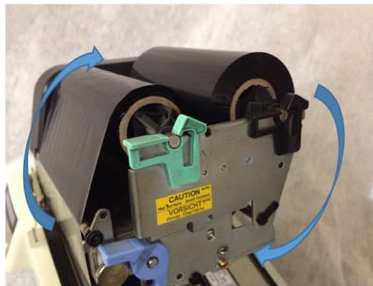
Ribbon loaded on a CLP-2001